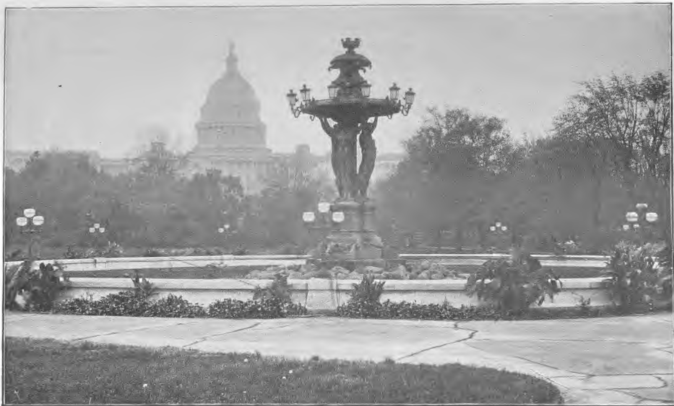
BARTHOLDI FOUNTAIN, WASHINGTON, D. C., WITH THE CAPITOL IN THE DISTANCE.