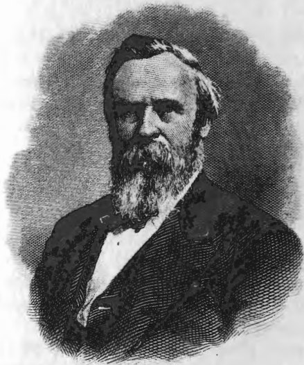
RUTHERFORD B HAYE