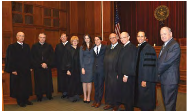
The winning team is flanked by members of the judging panel.