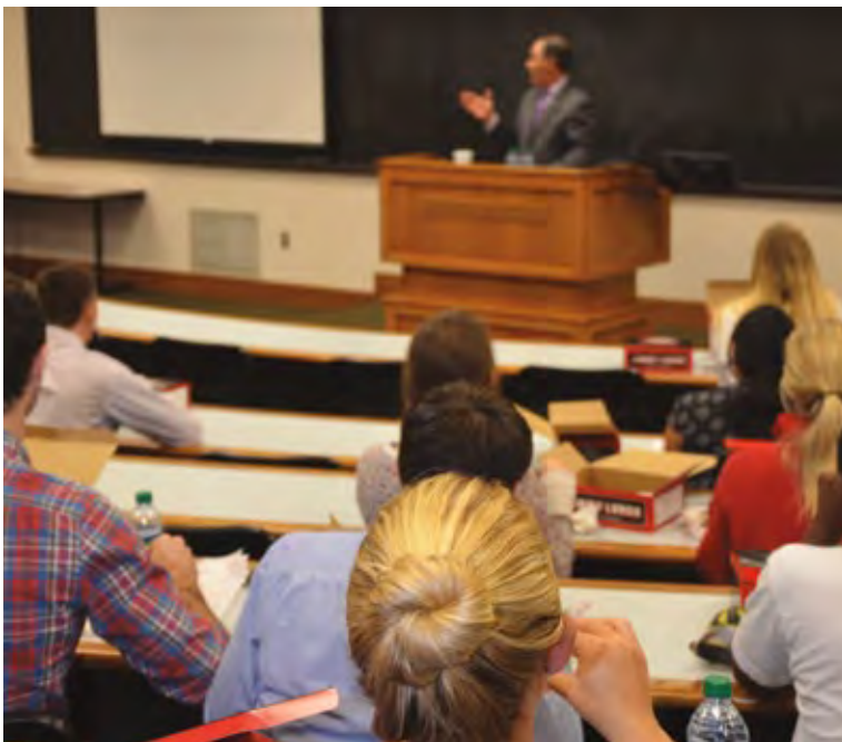
Oklahoma Attorney General Scott Pruitt tells students, "We're hiring and we want you to consider being part of our team at the Attorney General's Office."