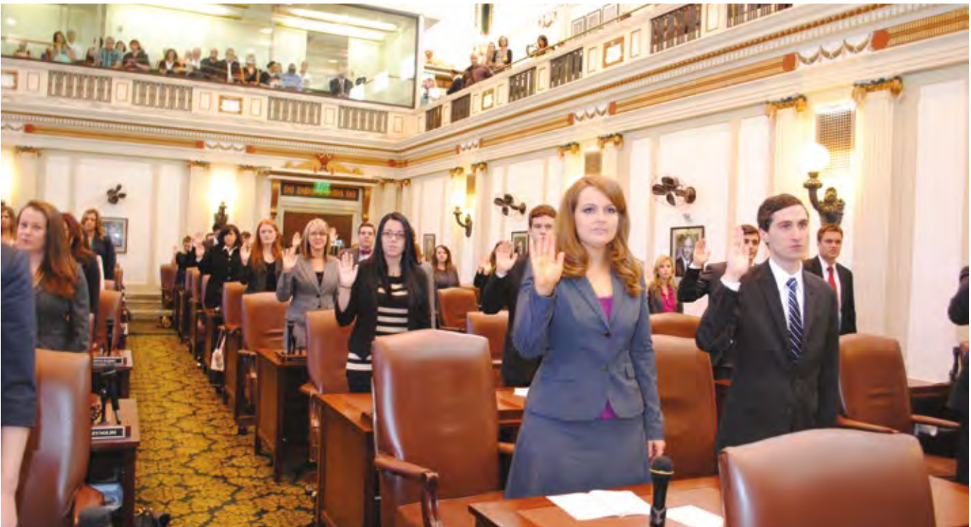
OU Law graduates take the Oath of Attorney during the Oklahoma Bar Association Admission Ceremony on September 25 in the House of Representatives Chambers at the Oklahoma State Capitol.