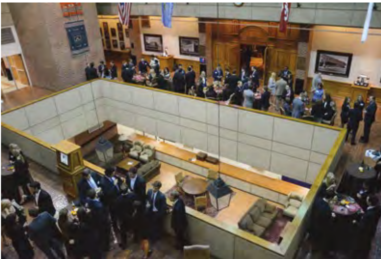
Students and attorneys visit at a reception in the Boren Atrium following the orientation session.