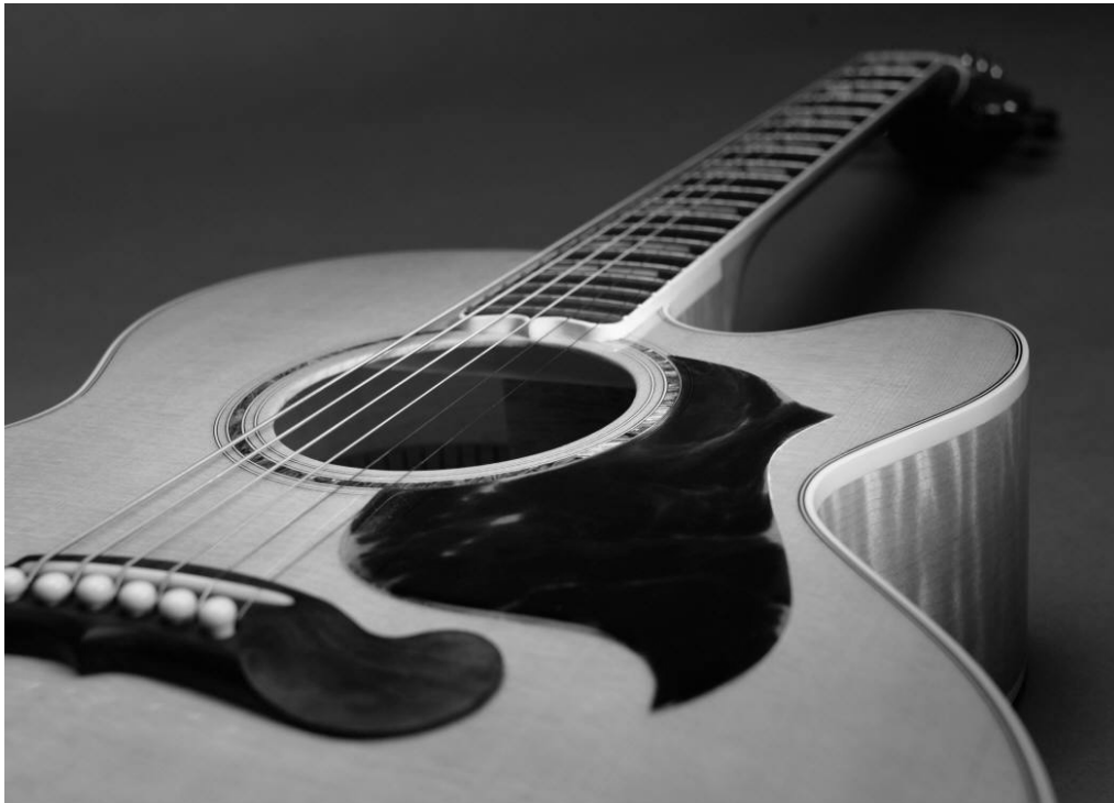
Figure 2: A Guitar

“Tablature – or tab, as it’s commonly referred to – is an alternative form of notation that is commonly used for guitar or bass. Guitar tab is specific to the guitar; other instruments cannot read this notation.” 24 However, to understand tab, one must first have a basic understanding of the guitar.